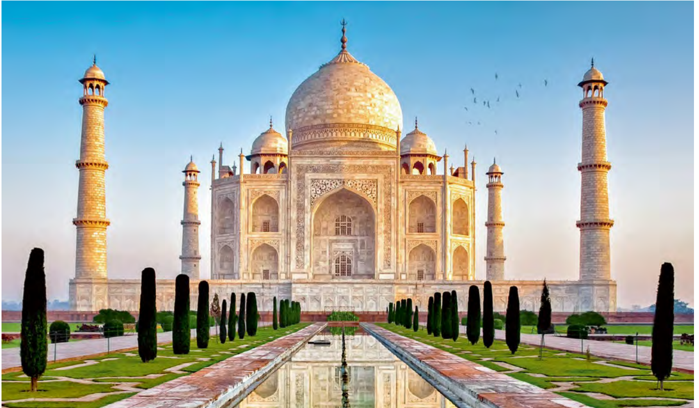
The majestic Taj Mahal is one of the New Seven Wonders of the World and a UNESCO World Heritage Site. A moment visitors never forget: stepping through the entrance gates and seeing the snow-white monument of infinite dimensions emerging on the horizon for the first time.