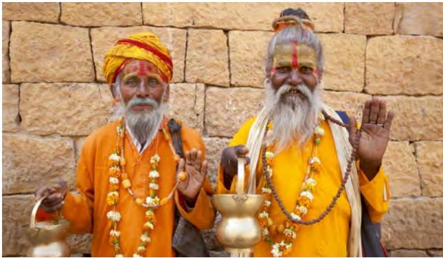
Priests are among the most revered individuals in India.