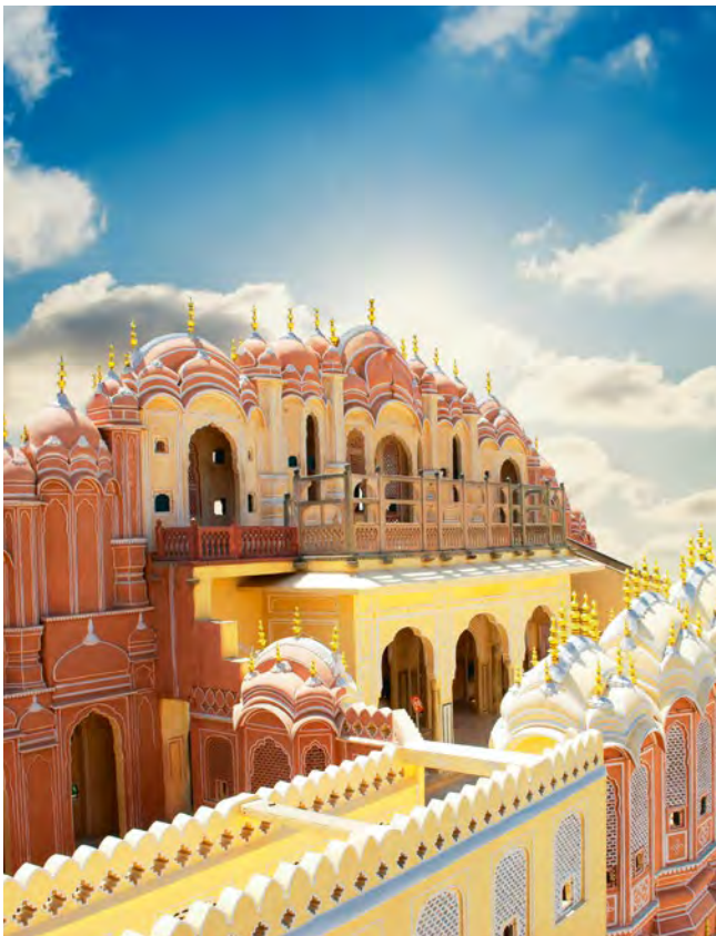
The iridescent façade of the Palace of the Winds, or Hawa Mahal. From behind its windows, noblewomen observed the busy bazaar.