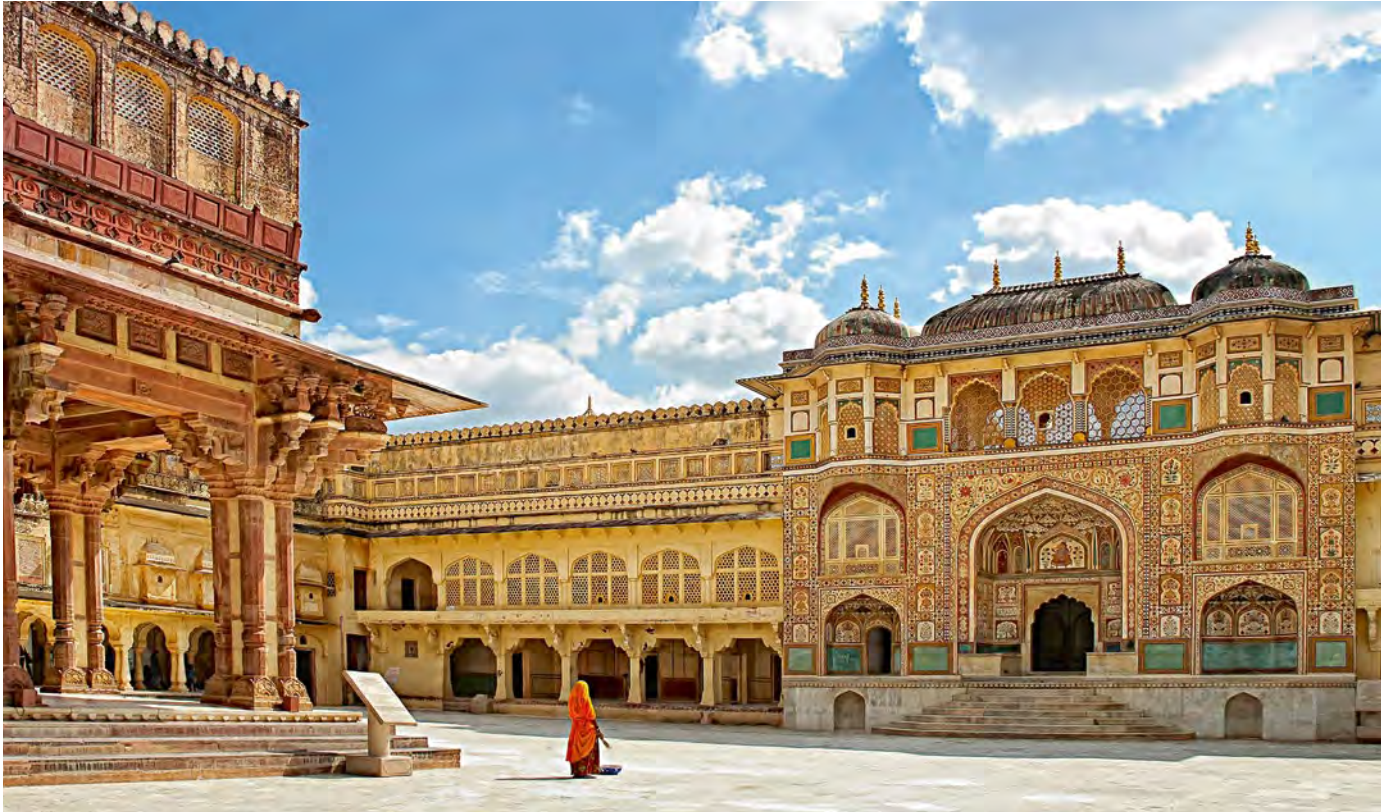
Not far from Jaipur, Rajasthan's gigantic Amber Fort, formerly the home of the Rajput maharajas, dazzles visitors with its sumptuous mirrored halls, once designed to reflect the flickering light of the candles used to illuminate the palace.