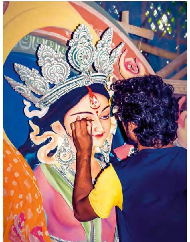
The potters' quarter Kumortuli in Calcutta is famous for manufacturing statues of hindu idols like Durga or Ganesh.