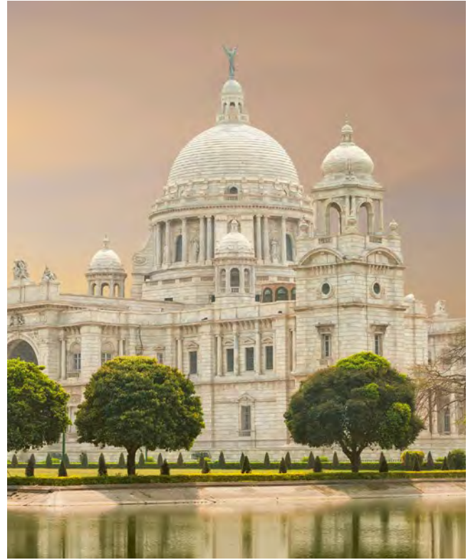
Calcutta's Victoria Memorial was built to honor Queen Victoria of the United Kingdom, who was also Empress of India until her death in 1901.