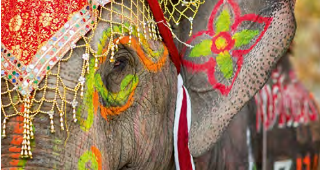
Elephants in traditional make-up: Hinduism deems them sacred—they represent loyalty, power, fertility, and wisdom.