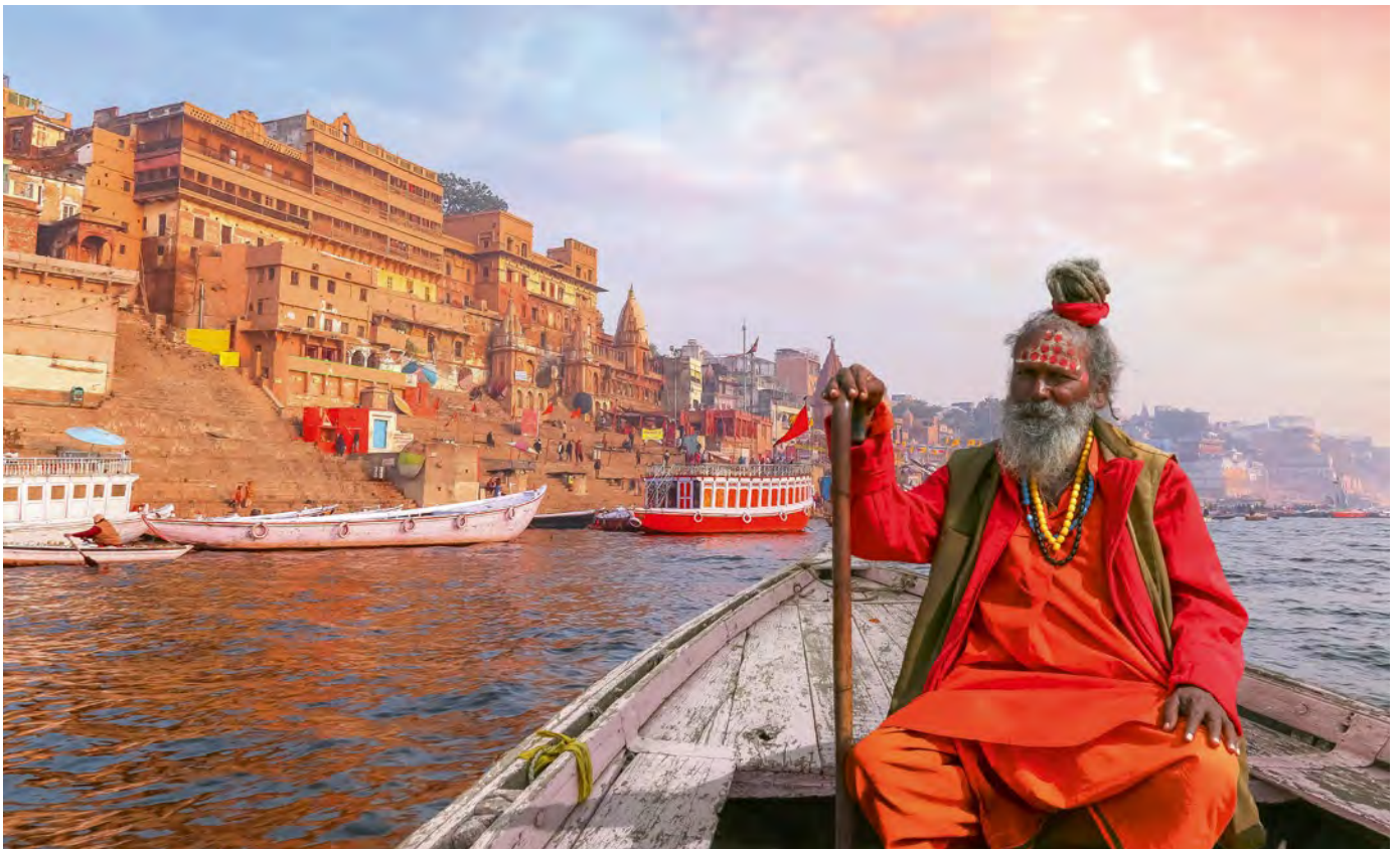
The Ganges is India's holy river, and in the holy pilgrims' city of Varanasi, the otherworldly Aarti light ceremony can be witnessed on the Ganges shores each night, truly broadening visitors' horizons.