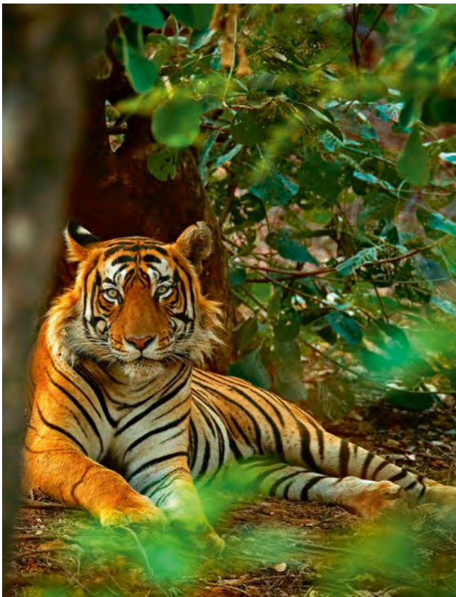
Tiger! Tiger! burning bright: In the forest of Ranthambore National Park, chances are excellent to spot these striped kitties.