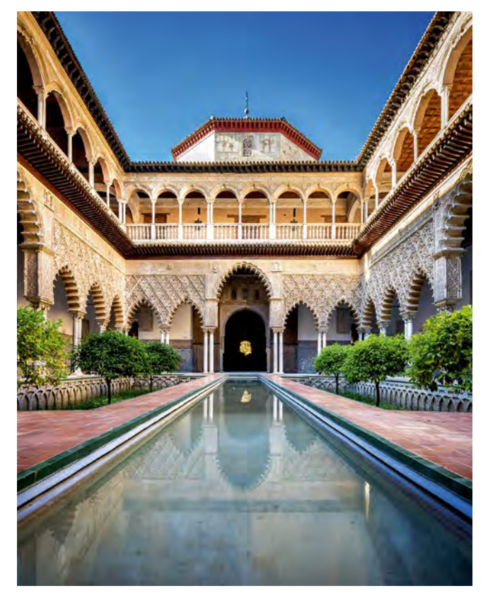
The medieval ALCAZAR PALACE OF SEVILLE boasts wonderful gardens you might recognize as the Water Gardens of Dorne from Game of Thrones .