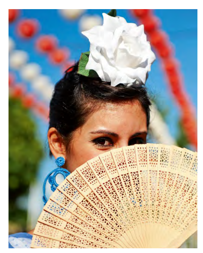
Welcome to ANDALUCIA , where there's a secret fan language to decode. The woman in the picture is covering her nose with an open fan, thus signifying "I want to see you."