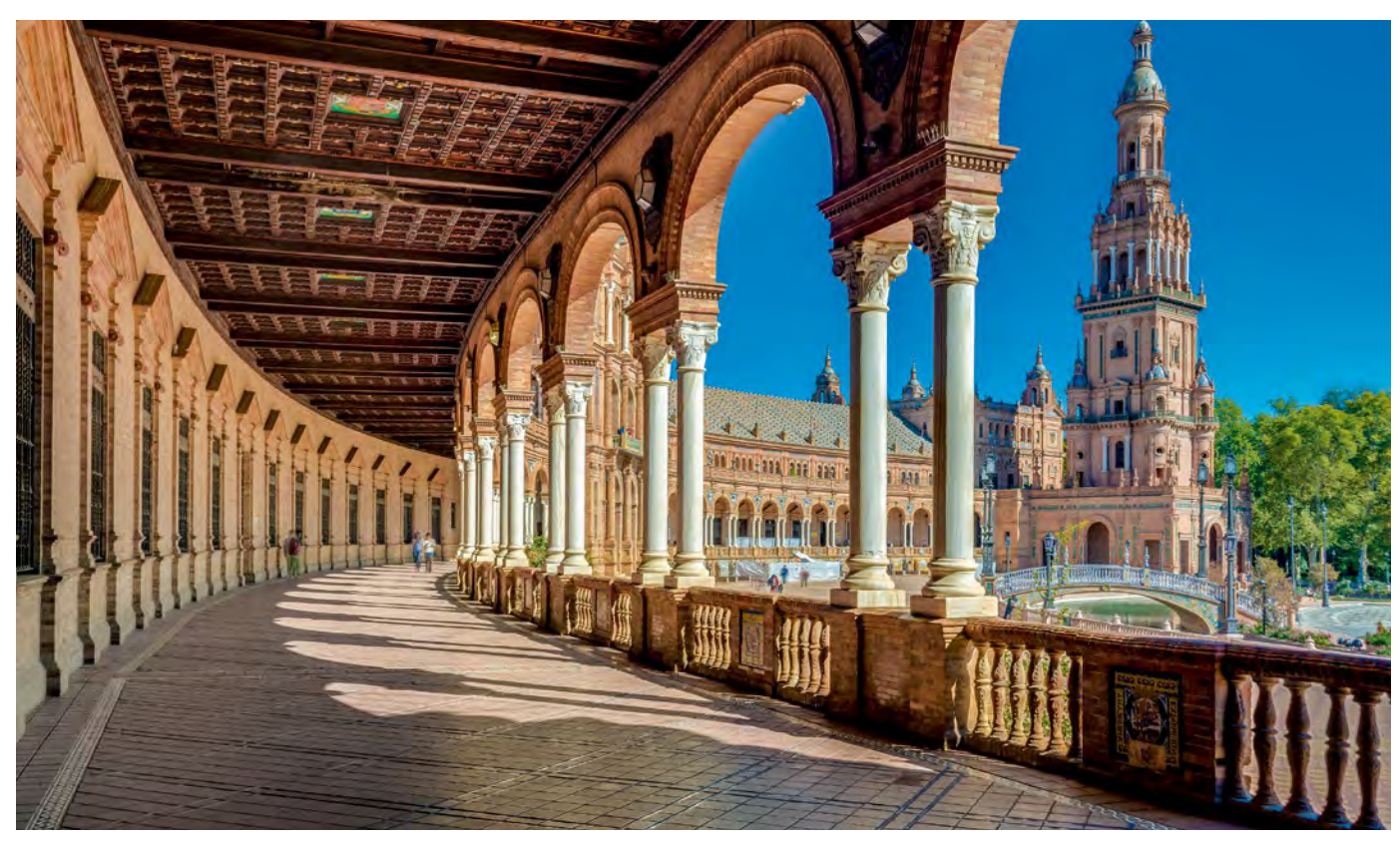
You've never been to Spain, but you know this place anyway? Well, it might be you're familiar with the City of Theed on the Planet Naboo. Because that's what the famous PLAZA DE ESPAÑA in Seville, built for the World's Fair in 1929, was supposed to depict in Star Wars II.