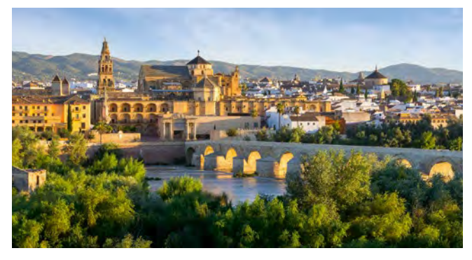
The Roman Bridge across the Guadalquivir River in the city of CÓRDOBA has been in service since about 45 BC.