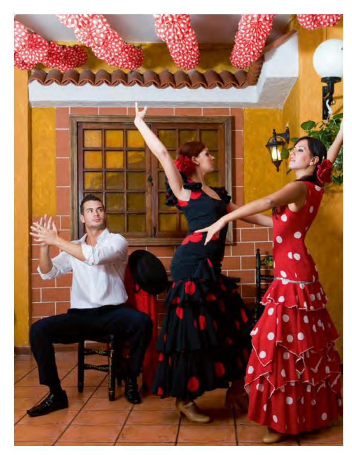
Who'd have thought they'd build a museum for a dance one day? But that's precisely what Seville's FLAMENCO MUSEUM is about.