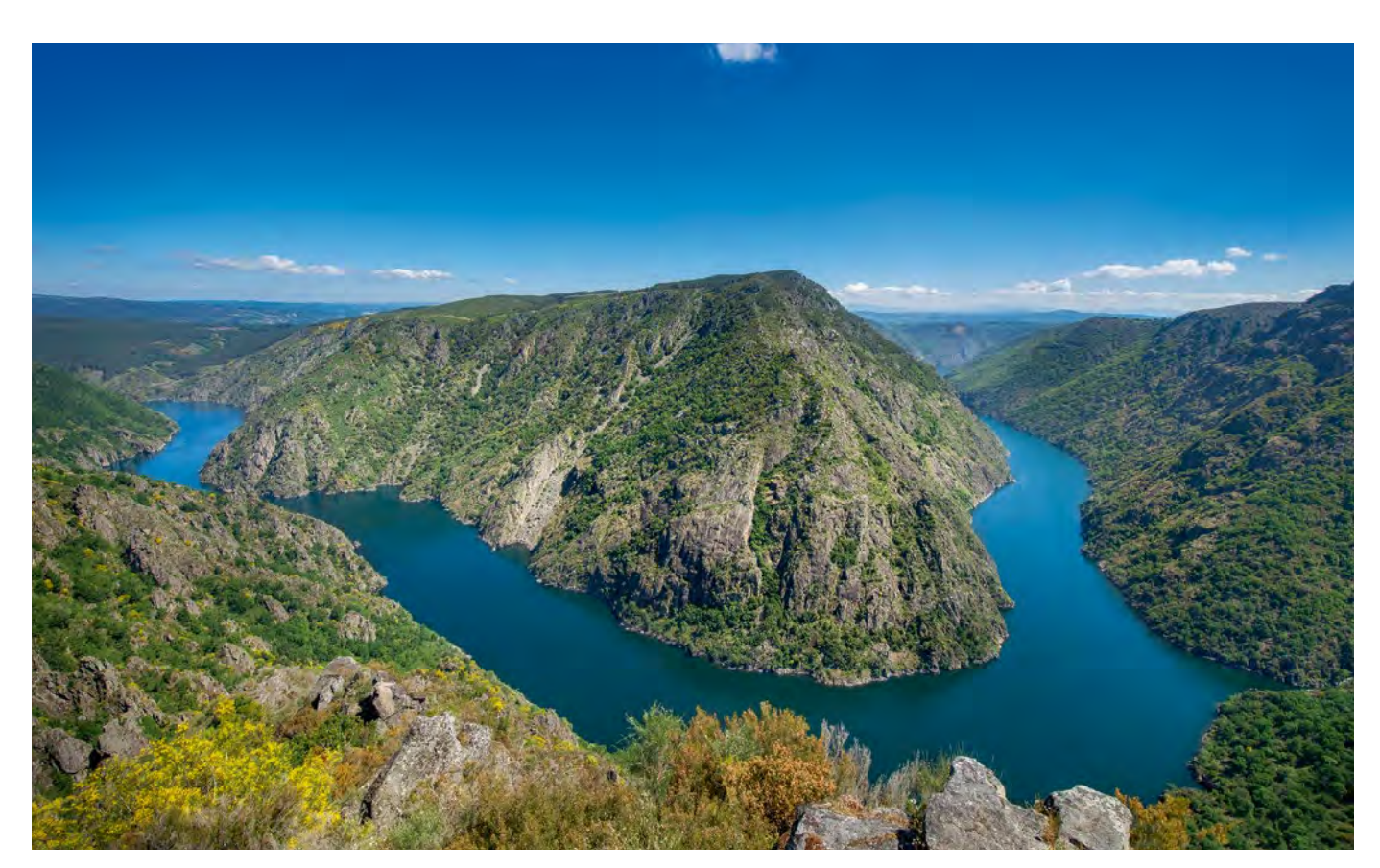
Simply gorgeous—if you pardon the pun. The GORGE OF SIL CANYON has been used for growing grapevines even in Roman days. The vast terraces that were built here are named Ribeira Sacra. If you spot this name on a bottle of red wine, you can be sure it'll be exquisite.