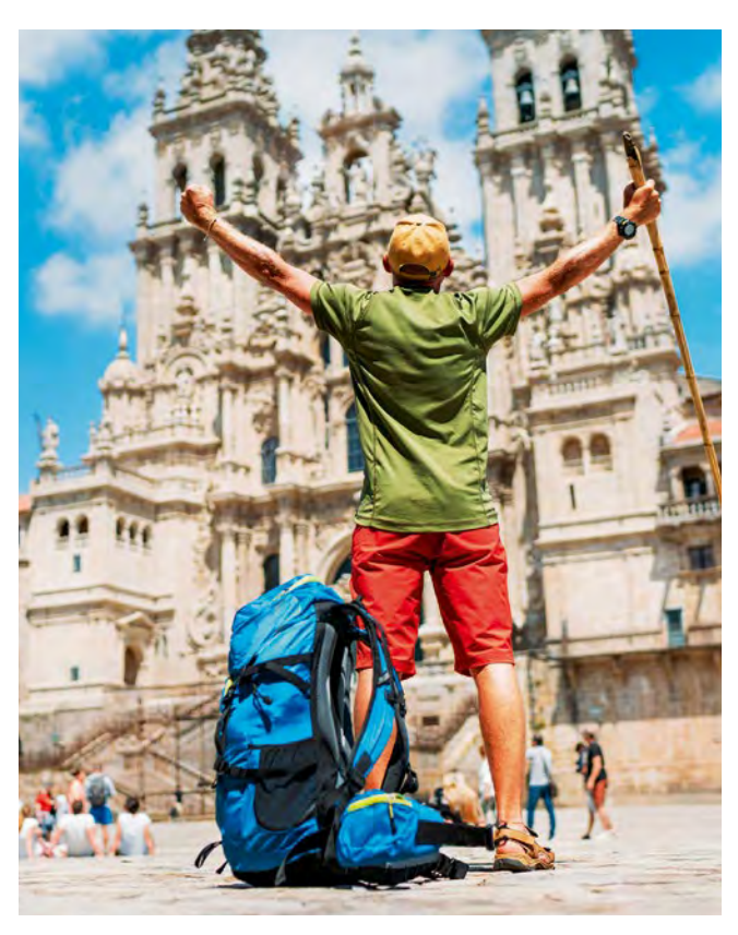
Up to 350,000 people per year undertake the 500-mile pilgrimage from France to the Cathedral of SANTIAGO DE COMPOSTELA .