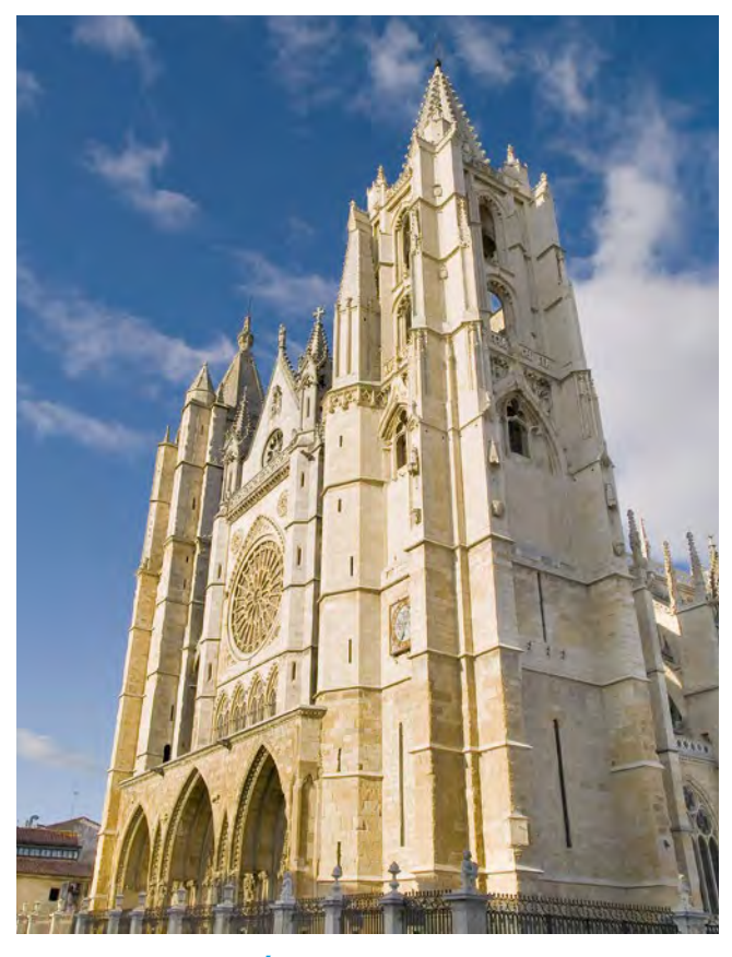
If the CATEDRAL DE LÉON looks all French to you, you're spot on. It's Spain's best example of French-style Gothic architecture.