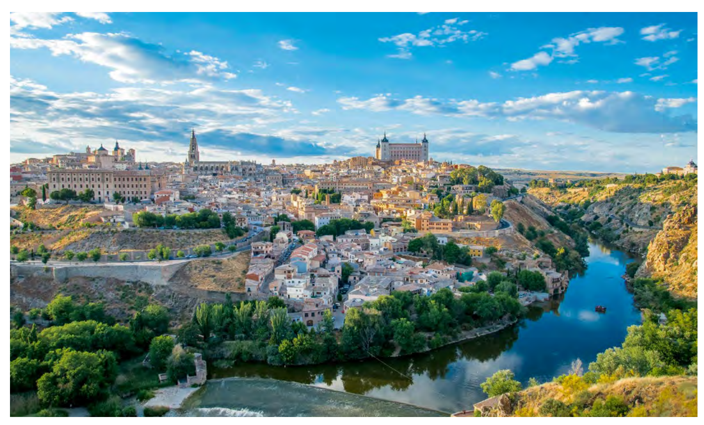
TOLEDO is known as the city of three cultures, since Christians, Jews, and Muslims have left their marks here. That explains oddities like the Mosque of Christ of the Light, which was once built as a mosque, then converted into a Christian church, and is now a museum.